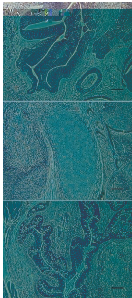
Full of potential. Human induced pluripotent cells form teratomas, tumors with multiple cell types.

The two human reprogramming papers could help solve some of the long-standing political and ethical fights about stem cells and cloning. The technique produces pluripotent cells, cells with the potential to become any cell type in the body, without involving either embryos or oocytes—two sticking